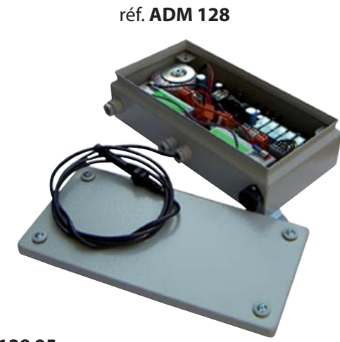
réf. ADM 128